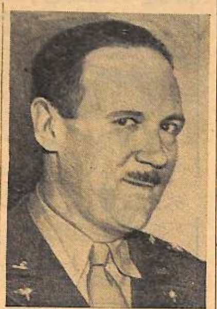
U.S. Army Signal Corps Photo Col. William Westlake

"The aircraft that have not received nearly enough recognition are the B25s (Mitchell) and the B26s (Marauder). Pilots take them 'way over the sea, shoot up and bomb enemy shipping, and some-times you see one come back, full of flak, landing-gear shot away and bomb doors refusing to close. There will be a crash