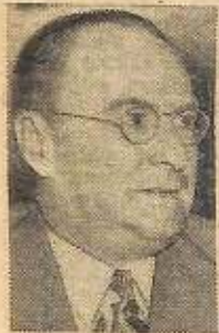
DONALD NELSON he left for China last week. It was understood that the letter mentioned another trip to the Pacific—possibly to New Zealand and Australia—for Nelson after his present job was completed.

A Presidential letter notified Nelson of the appointment shortly before he left for China last week. It was understood that the letter mentioned another trip to the Pacific—possibly to New Zealand and Australia—for Nelson after his present job was completed.